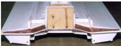
The transom was stiffened, ride surfaces sharpened and spray rails added

Spray rails and strakes create lift and reduce drag. A small L-shaped extrusion sharpens the inside sponson edges. A 1/4" L-shaped extrusion makes an inverted spray rail along the outside of the sponsons.